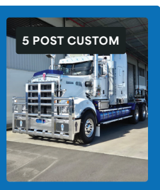
5 POST CUSTOM