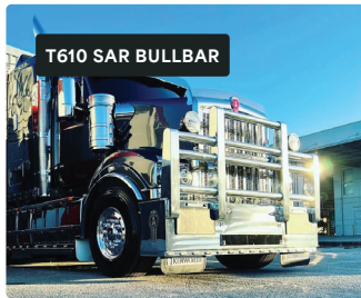
T610 SAR BULLBAR