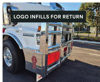
LOGO INFILLS FOR RETURN