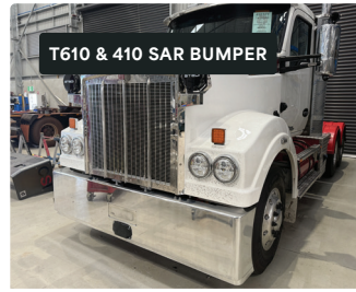
T610 & 410 SAR BUMPER