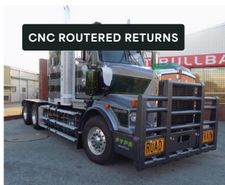
CNC ROUTERED RETURNS