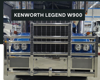
KENWORTH LEGEND W900